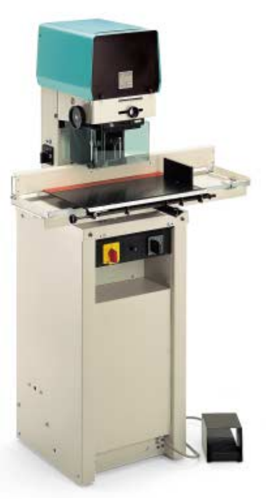
Citoborma 280AB: Power stroke for high performance

To make work more convenient and efficient a foot treadle or a power stroke are available as an option