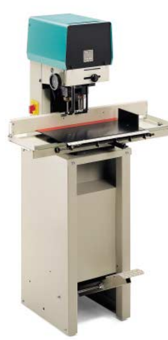
Citoborma 280B: Foot treadle to give easy of operation

Citoborma drills have been building up their excellent reputation starting back in 1938. They offer the perfect solution for every drilling application (paper, cardboard, plastic, textiles, leather).